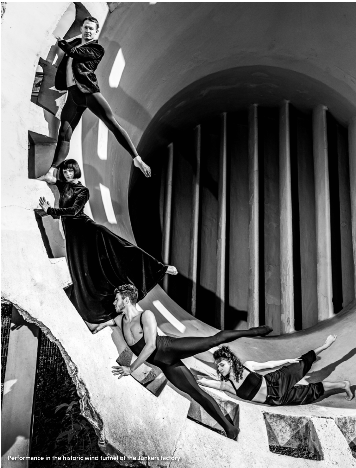
Performance in the historic wind tunnel of the Junkers factory