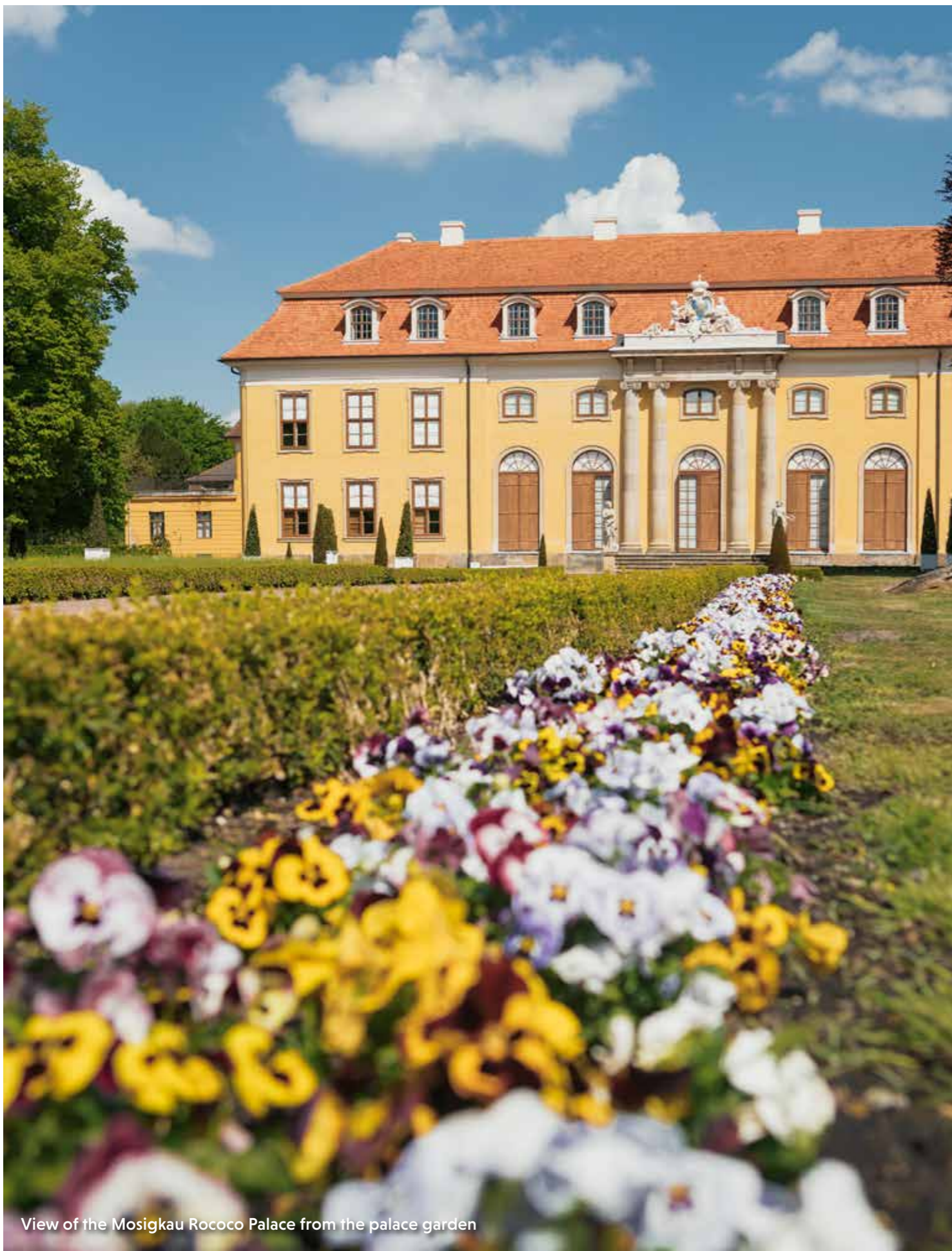
View of the Mosigkau Rococo Palace from the palace garden