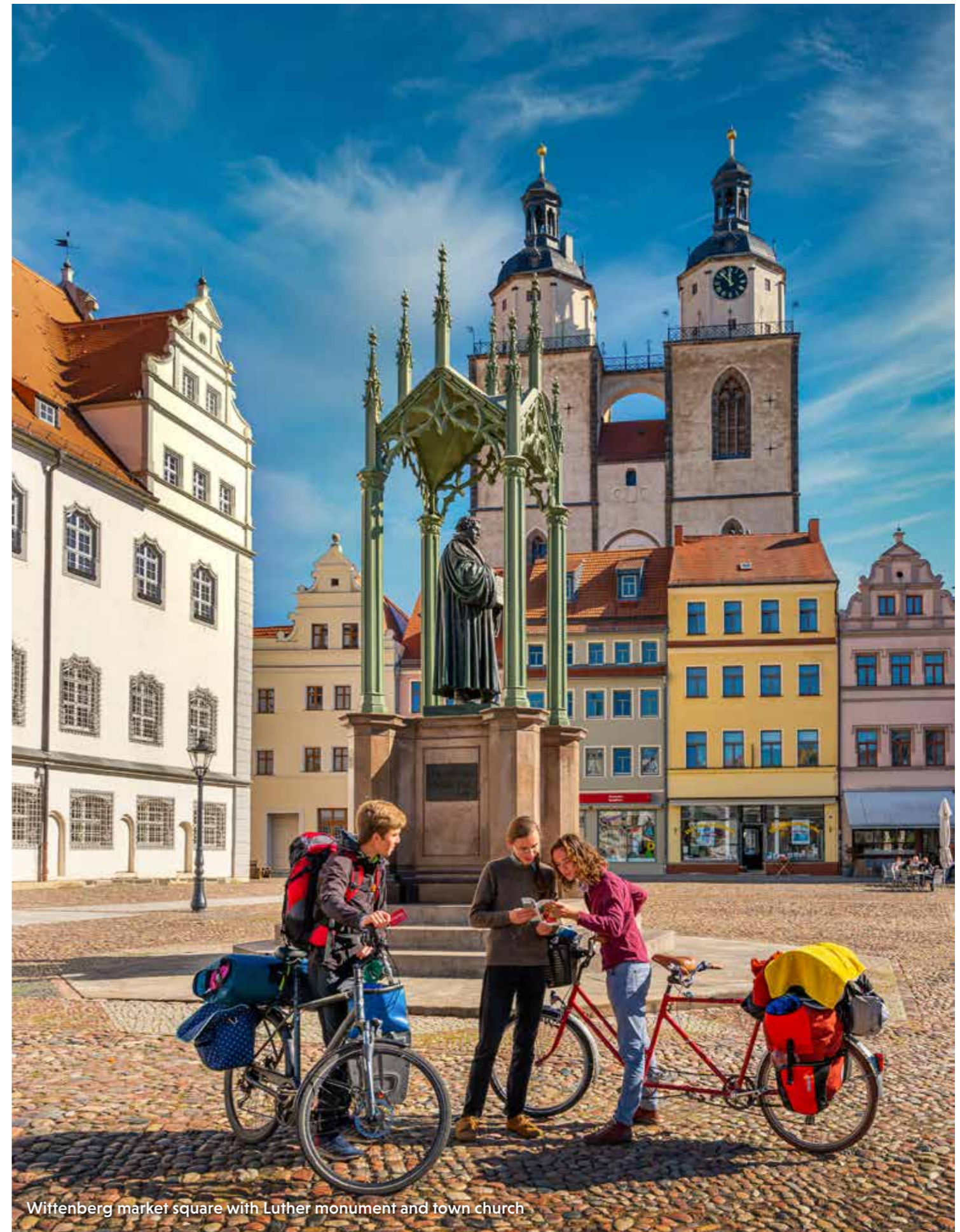
Wittenberg market square with Luther monument and town church