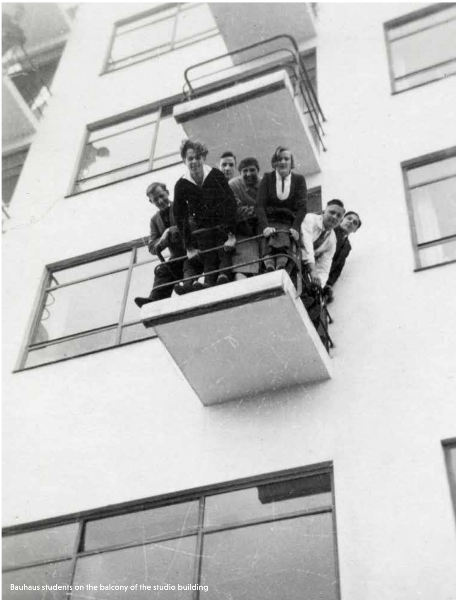
Bauhaus students on the balcony of the studio building

To this day, the town and its surrounding region reflect this European way of thinking in many different ways. Discover UNESCO World Heritage sites, the venues of the region's eventful history, cultural gems, gorgeous gardens, unspoiled river landscapes and much more besides.