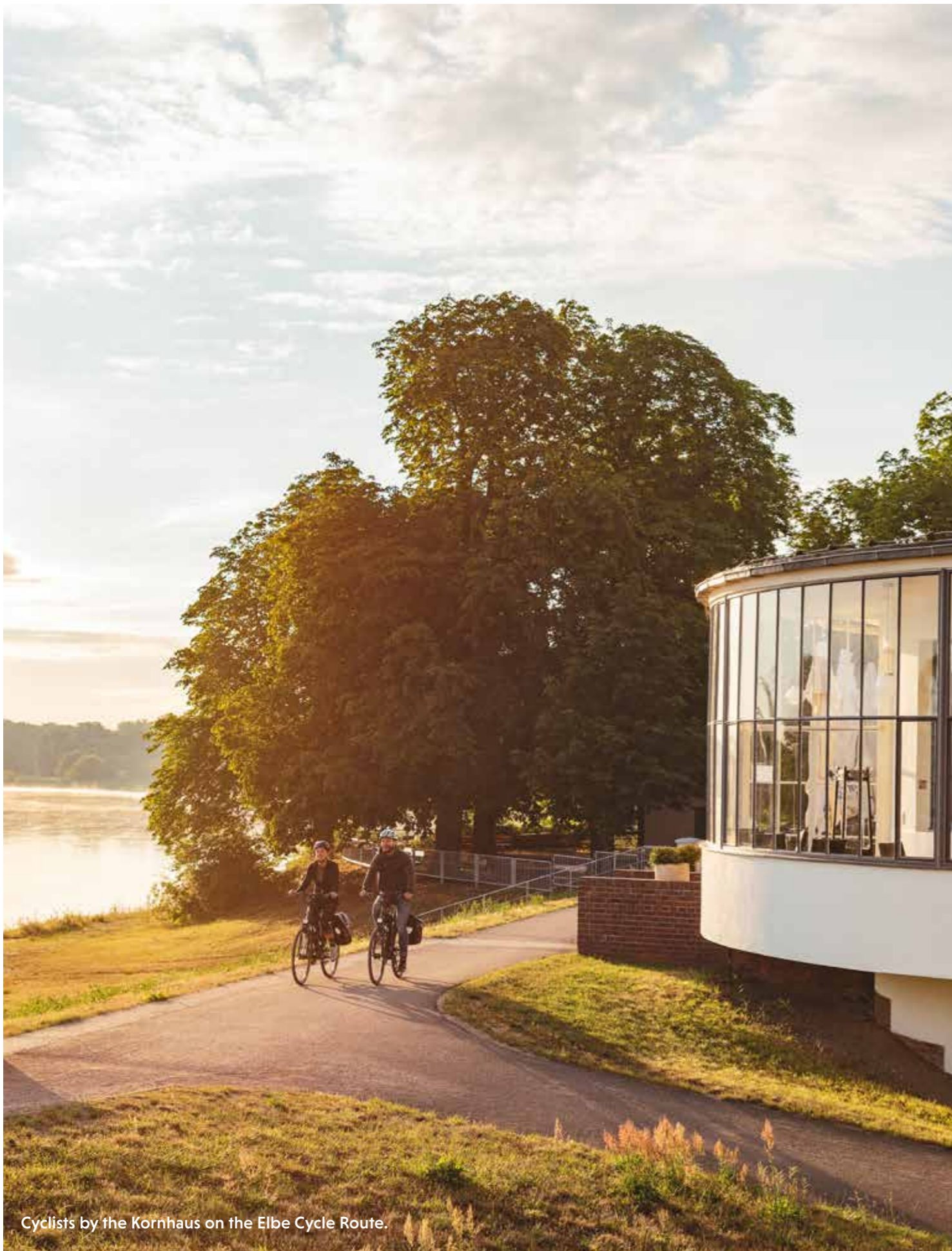
Cyclists by the Kornhaus on the Elbe Cycle Route.