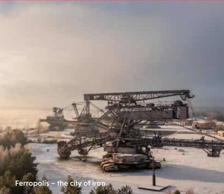
Ferropolis – the city of iron

Whether you travel back in time to the year 1517 in the Asisi Panorama or visit the original sites Castle Church, Melancthon House, Town Church and Luther House in the historic town centre, all part of the UNESCO World Heritage: Lutherstadt Wittenberg offers many opportunities to discover the history of the Reformation.