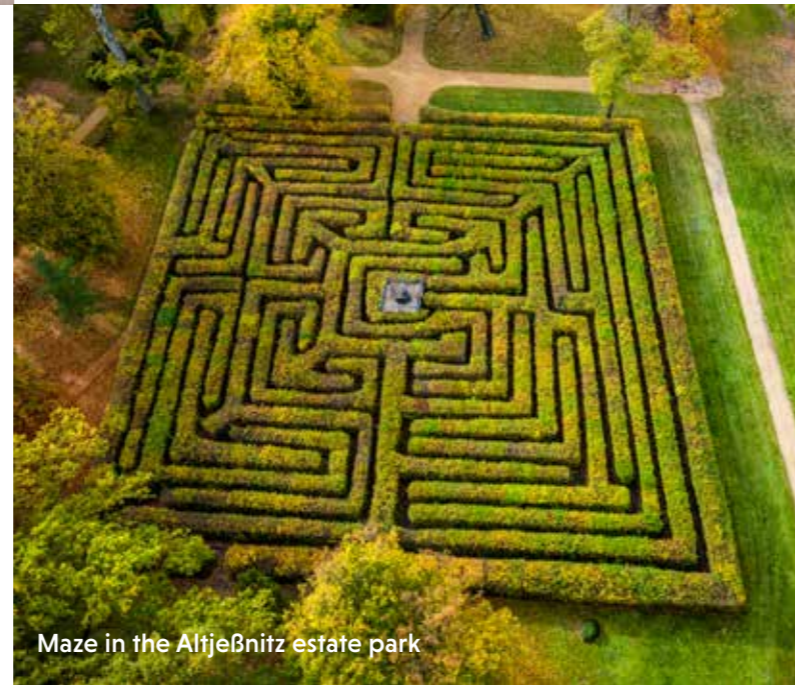
Maze in the Altjeßnitz estate park